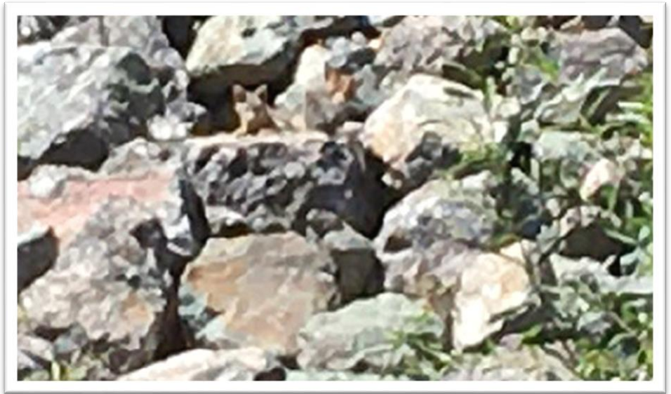
A pair of foxes in the bank repair installed in 2020 watching our construction planning meeting from the opposite side of Dry Creek.

minimal environmental impact. The grading and habitat feature installation on the site on the west side of the Creek, a backwater feature, is essentially complete. The site on the east side of the Creek, a flowing side channel, has been excavated down to the groundwater level and will soon be isolated from the mainstem of the creek to allow grading the wetted portion of the channel. Hanford expects to complete construction by mid to late September, in advance of the October 15 in-stream work deadline. During a recent field meeting, Sonoma Water staff were pleasantly surprised to see that a family of foxes has created a den in the bank repair constructed in 2020.