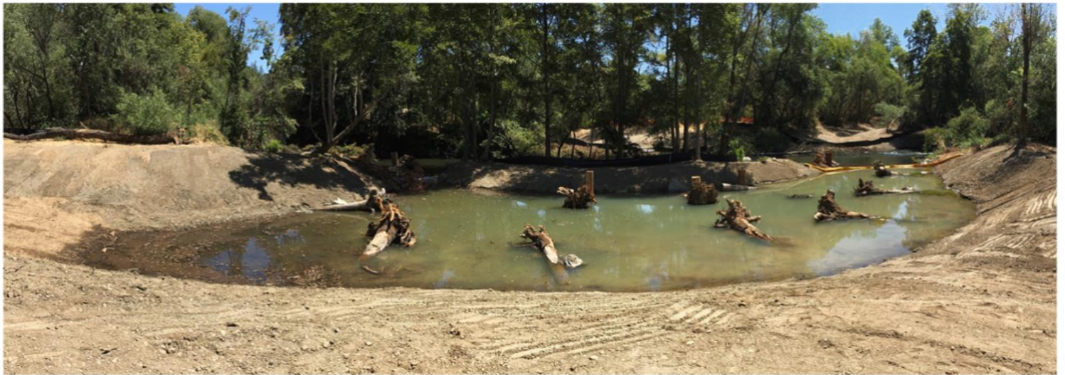
Backwater habitat feature on west side of Dry Creek.