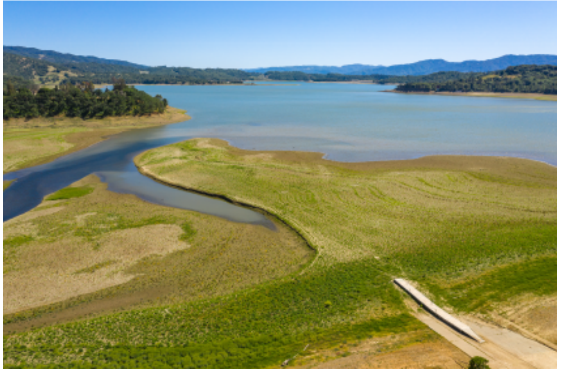
This photo of Lake Mendocino was taken in May of 2021.

On May 11, 2021, Sonoma Water filed Temporary Urgency Change Petitions (Petitions) to request a reduction in minimum instream flow requirements for the Lower Russian River and the Upper Russian River. This is in response to very low storage levels at both Lake Mendocino and Lake Sonoma. An Order approving the Petitions was approved on June 14, 2021. The Order includes a number of monitoring and reporting requirements. In addition, it requires Sonoma Water to reduce its Russian River diversions by 20 percent for the term of the Order compared to the same period in 2020 through the term of the Order in an additional effort to preserve storage at Lake Sonoma. The Order was implemented immediately and expires in December of 2021.